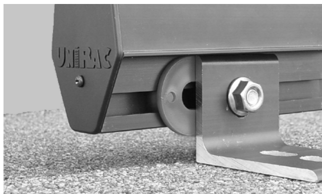
Shim (1/8") used for precise alignment of SunFrame rail. For purposes of illustration, the shim is to the left of its final position around the bolt shaft.