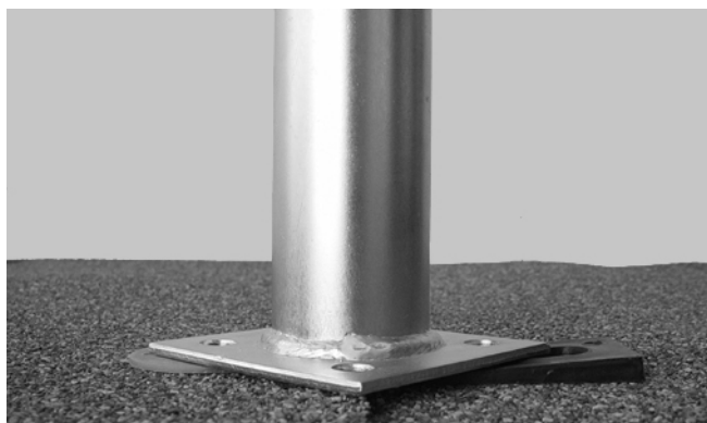
In combination, shims (1/16" and tapered) level standoff.