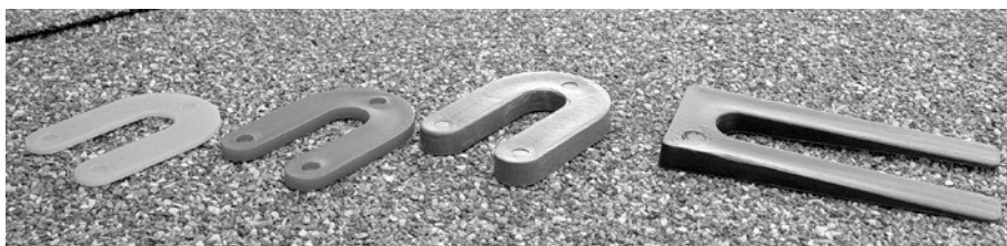
Part no. 990105 1 1/2" x 2" x 1/16" (blue)

Shims are structural elements. Photographs below illustrate examples of correct use.